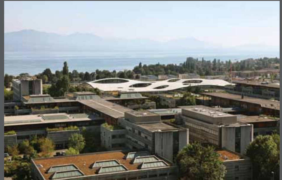
Right Rolex Learning Center, Lausanne, Switzerland, 2010, by SANAA