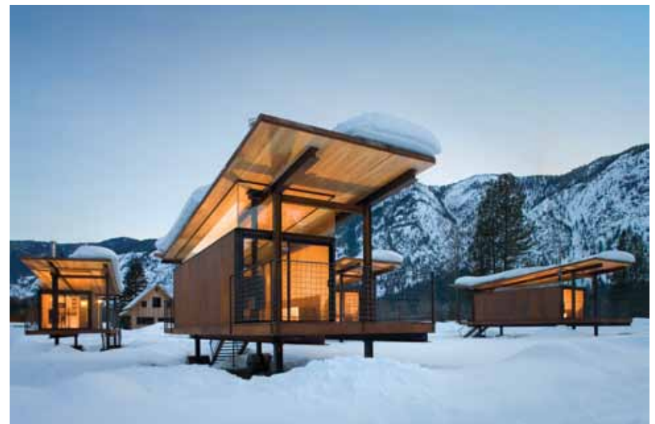
Below Rolling Huts Mazama, WA, USA 2007 by Olson Kundig Architects.

Geological Society, Piccadilly 6.30–7.45 pm; £12/£6 reductions*