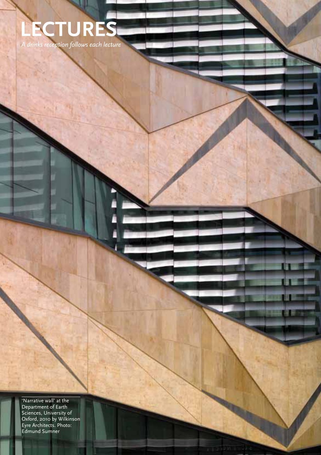
'Narrative wall' at the Department of Earth Sciences, University of Oxford, 2010 by Wilkinson Eyre Architects.