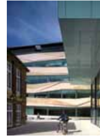
Above Department of Earth Sciences, University of Oxford, 2010 by Wilkinson Eyre Architects.